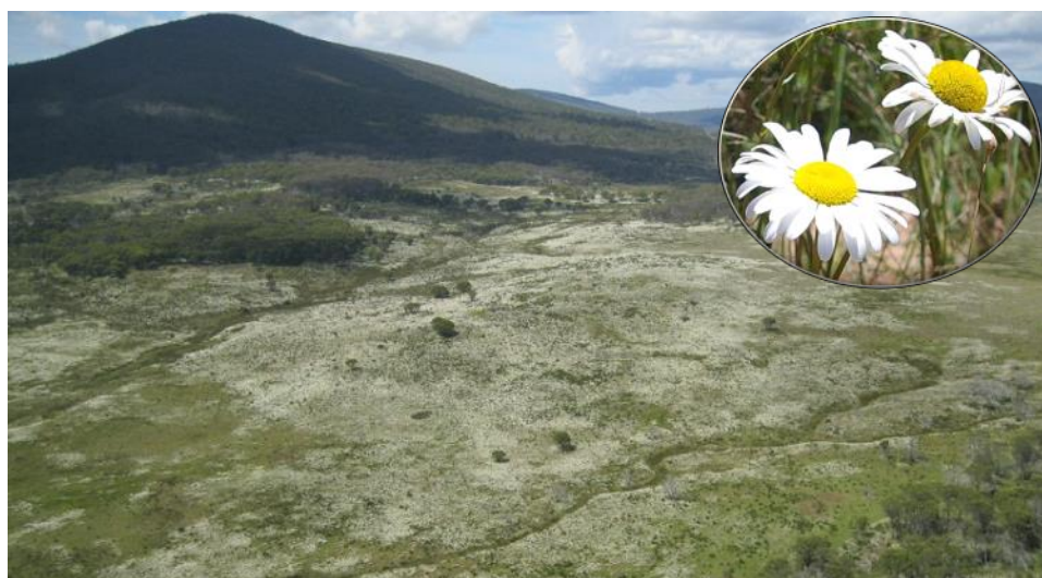
Ox-eye daisy is an aggressive invader of sub-alpine grasslands, snow gum woodlands and wetlands in Kosiuszko National Park in New South Wales, Australia

Ox-eye daisy ( Leucanthemum vulgare ) is naturalized in South Africa but has the potential to become a serious invader of grasslands. This species is recognized as a threat to agriculture and biodiversity in North America and Australia where biological control is under investigation. Perhaps South Africa could benefit from these investigations and take steps to prevent wide-spread invasion.